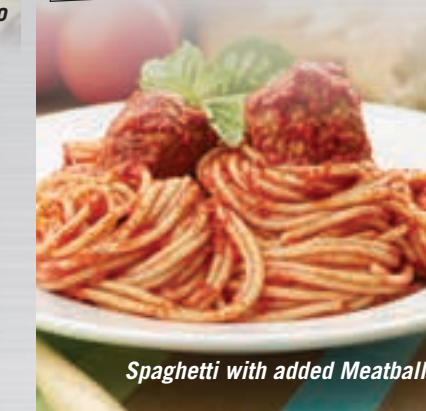
Spaghetti with added Meatballs

Pasta Tray Ziti or rigatoni 39.99 With meatballs (20) 59.99 Italian Salad Tray 22.99