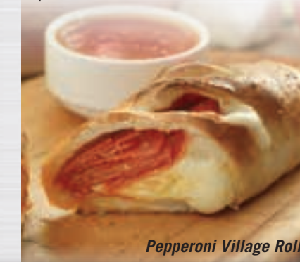
Pepperoni Village Roll

An over-stuffed pizza pocket, baked to perfection, loaded with ricotta, mozzarella & your choice of fillings, served with a side of marinara. ADDITIONAL PIZZA TOPPINGS 1.99 (ea) Ricotta & Mozzarella 9.99 Italian Ham, salami & pepperoni 11.99 Veggie Green peppers, tomatos, mushrooms, onions & black olives 11.99 Steak Seasoned shaved sirloin 11.99 Chicken Grilled chicken 11.99 Gyro Sliced gyro meat off the spit with cucumber sauce 11.99